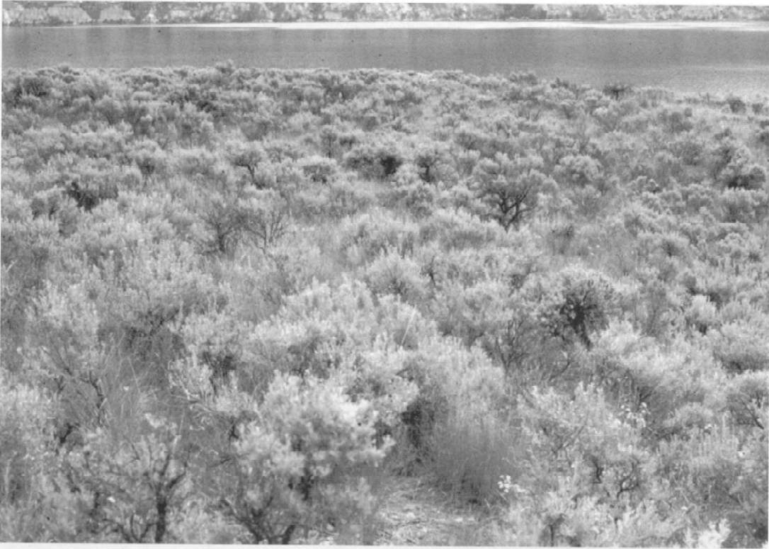
FIGURE 2. Photograph of the sagebrush habitat at Summerland in the Okanagan Valley, south-central British Columbia, Canada.

from the sample of animals captured in each trapping session and then summed for summer periods. Juvenile survival is an index relating recruitment of young into the trappable population to the number of lactating females (Krebs 1966). A modified version of this index is number of juvenile animals at week t divided by the number of lactating females caught in week t - 4 . Mean survival rates (28-day) for summer and winter periods were estimated from the Jolly-Seber model.