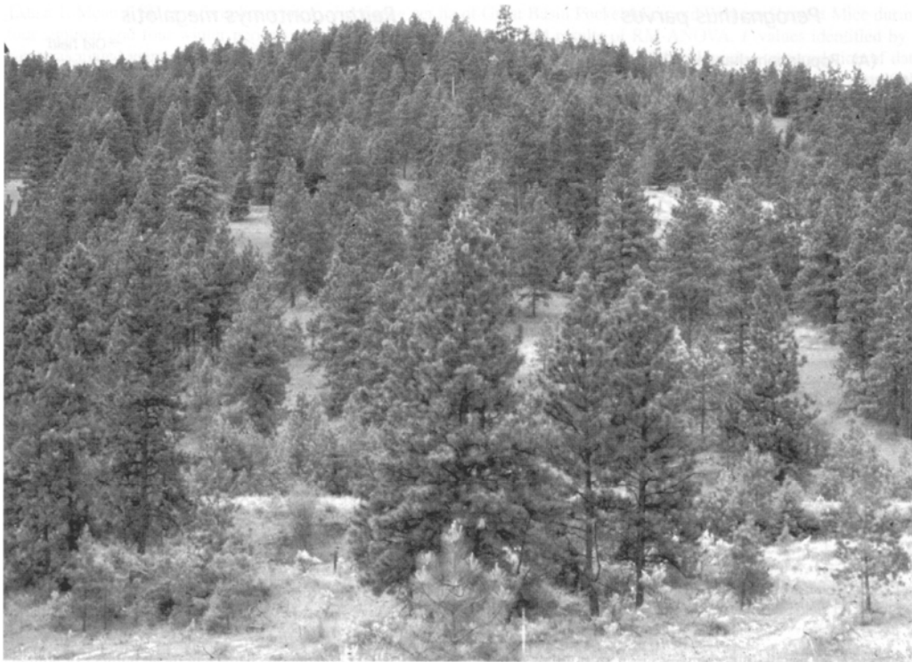
FIGURE 3. Photograph of the Ponderosa Pine forest habitat at Summerland in the Okanagan Valley, south-central British Columbia, Canada.

45.5 animals/ha in sagebrush habitats in 1999, with declining abundance in 2001 and 2002 (Figure 4A). Mean density of Great Basin Pocket Mice per ha was similar ( F_{2,6} = 3.48 , P = 0.10 ) among sites, ranging from lows of 12.0-13.7 to highs of 22.2-28.0 (Table 1). The very low numbers recorded in winter 2002-2003 likely reflect hibernation. Population changes of Great Basin Pocket Mice were very similar between the old field and pine forest habitats (Figure 4A). Highest mean overall density per ha consistently occurred in the sage habitat (19.0) compared with the old field (5.0) or pine forest (5.1) habitats (Figure 4B). This pattern occurred in all years except summer 2001 when the sage and pine forest had statistically similar numbers, based on the significant site \times time interaction. The Great Basin Pocket Mouse was not captured during the winter seasons of sampling owing to hibernation.