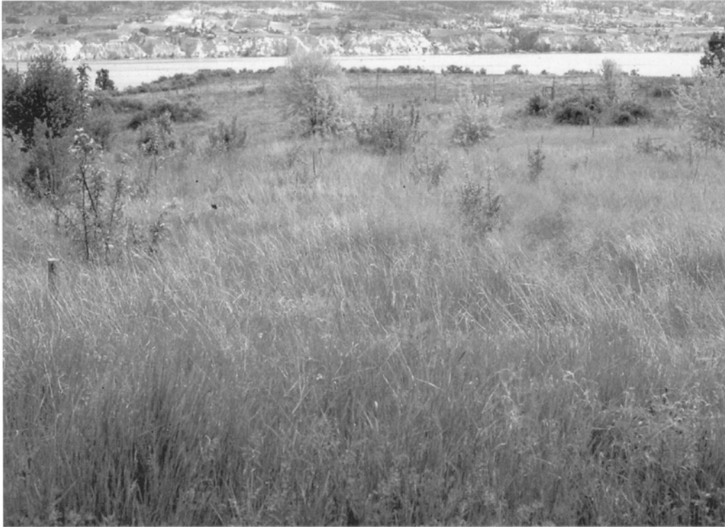
FIGURE 1. Photograph of the old field habitat at Summerland in the Okanagan Valley, south-central British Columbia, Canada.

were set on the afternoon of day 1, checked on the morning and afternoon of day 2 and morning of day 3, and then locked open between trapping sessions.